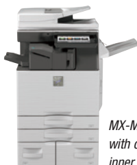
MX-M6050 shown with compact inner finisher.

When it’s time to get the job done, the Essentials Series monochrome document systems are outstanding performers. Quickly scan documents at speeds up to 80 images per minute . Then use the manual stapling feature on select finishers to restaple your originals. Multiple finishing options give you the output you require, be it stacked, stapled or saddle-stitched. There’s even an available built-in stapleless staple feature, which can bind up to five sheets of paper by adding a crimp to the corner of the set, saving regular staples for larger sets.