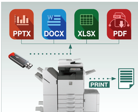
Direct print to popular file formats seamlessly with Sharp's available Direct Print Expansion Kit. 1