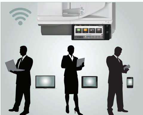
Available wireless network interface for convenient scanning and printing from mobile devices.

From paper handling to networking, the MX-M5050 and MX-M6050 monochrome Essentials Series will exceed your expectations.