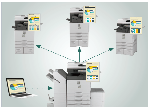
With Serverless Print Release you can securely print a job and release it from up to six Essentials Series models (including host).