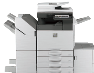
MX-M6050 shown with 3K saddle stitch finisher and large capacity cassette.